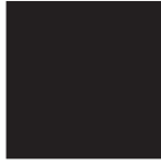
Black HPL with black edge (thickness 12 mm)