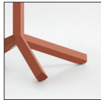
Red Beige (RAL 3012)