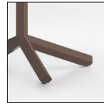
Grey Beige (RAL 7006)