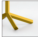
Yellow (RAL 1018)