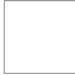
White HPL with black edge (thickness 12 mm)