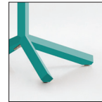
Light green (RAL 6027)