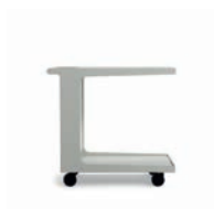
SURF Table By Maximilian Schmah